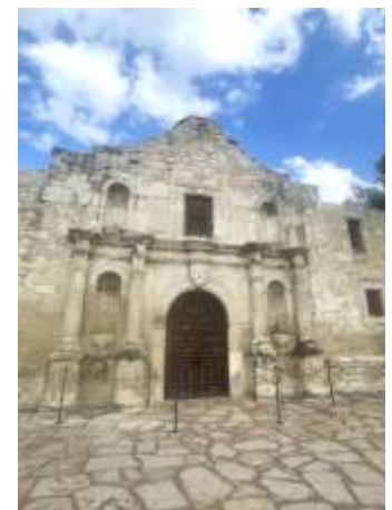
Remember the Alamo